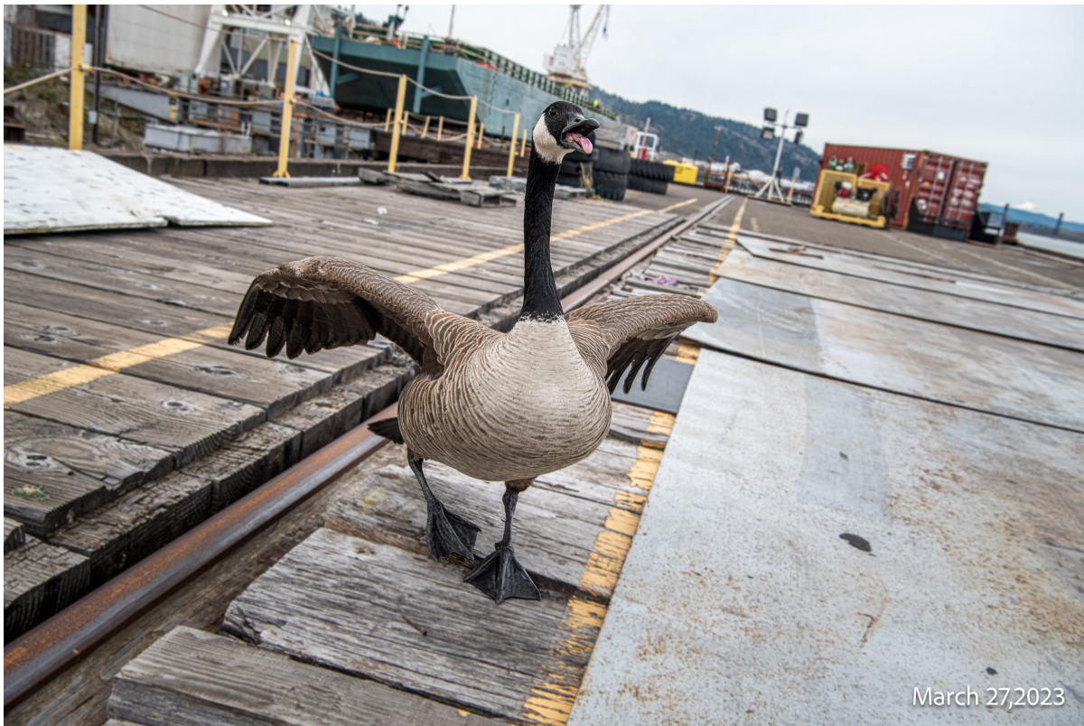
Photo of a local industrial sanctuary citizen was taken at the Gunderson plant.

If you'd like to participate in our monthly meetings, contact James Horsley .